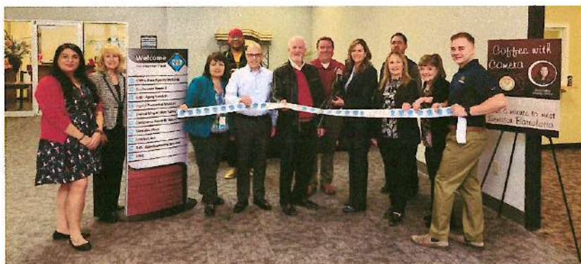
Senator Camera Bartolotta, Mon Valley Office 303 Chamber Plaza, Suite B, Charleroi