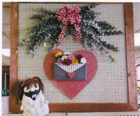
Joseph's Nursery Monessen