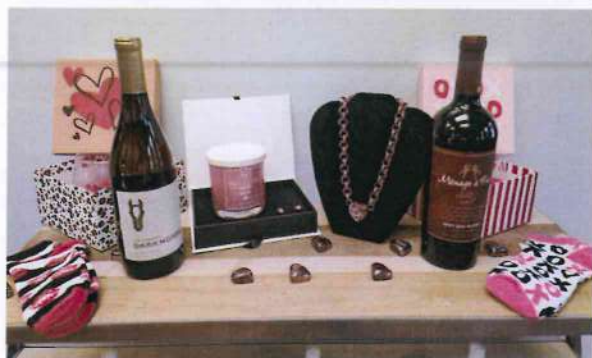
Studio K Charleroi