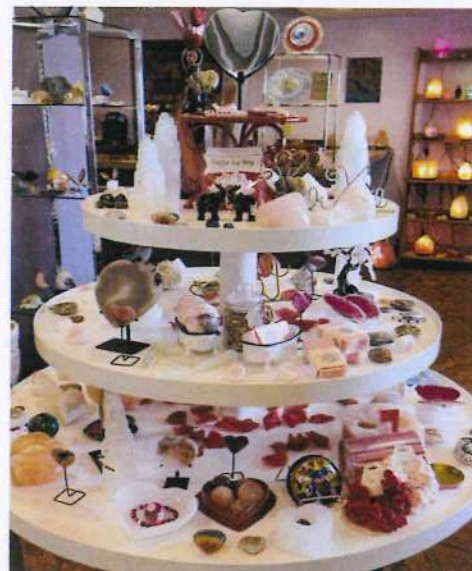
Sol Wellness Center Rostraver Twp