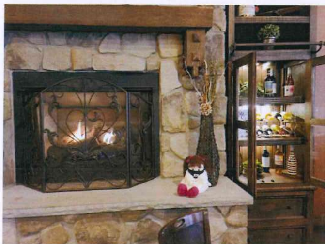
River House, Charleroi