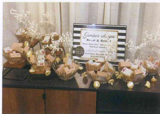
Jazzy Boutique, Belle Vernon