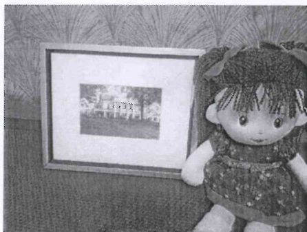
Lucy attended a Chamber Luncheon at the Mon Valley Country Club in February

Local Lucy is the Chamber Mascot. Lucy visits member businesses and then posts on Facebook. If you guess where Lucy is your name goes in a drawing for a prize.