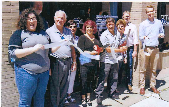
Mon Valley Initiative