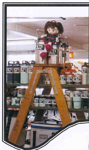
Coulson's Sales & Service