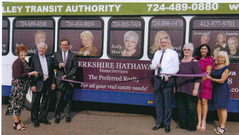
Berkshire Hathaway HomeServices