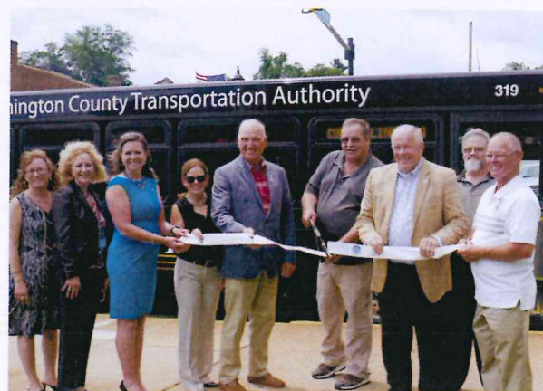
Freedom Transit Washington County Transportation Authority