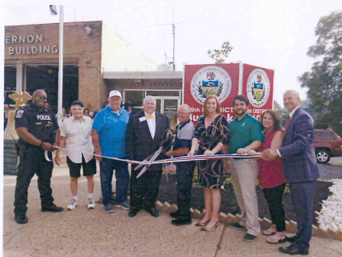
State Representative Bud Cook