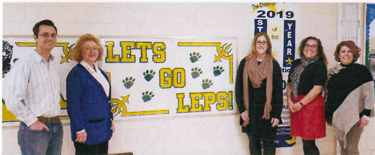
BVA Senior Project Day