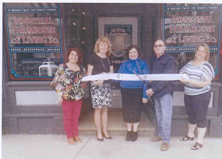
Industrial Farmhouse Living