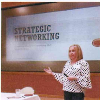
April Lunch & Learn