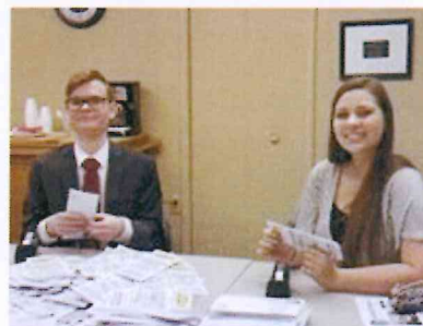
Student Government Day