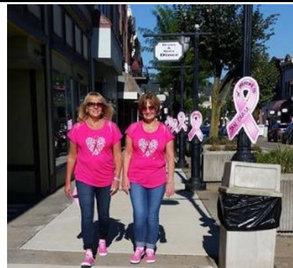
14th Annual MVH Lois Orange Ducoeur Breast Walk.