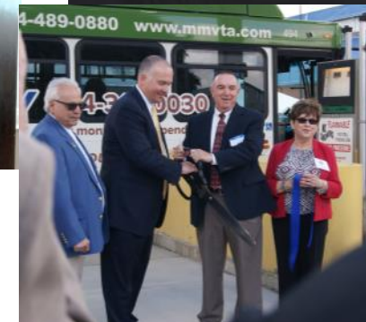
Ribbon cuttings at MMV Transit Authority CNG fueling station and cfsbank's new Southpointe location