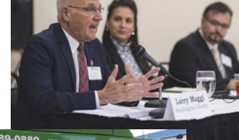
MVRCC Hosts Washington, Westmoreland and Fayette County Commissioners