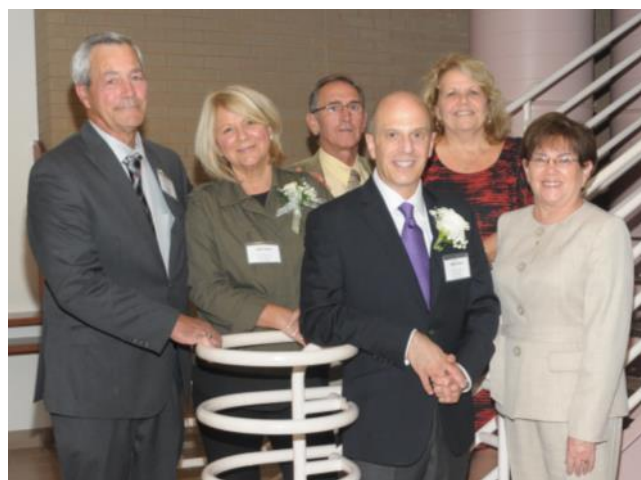
United Way of Mon Valley