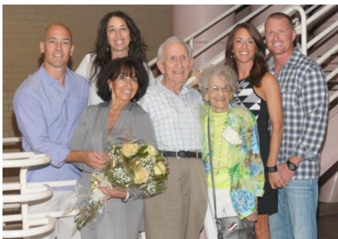
Susan Jo's Salon