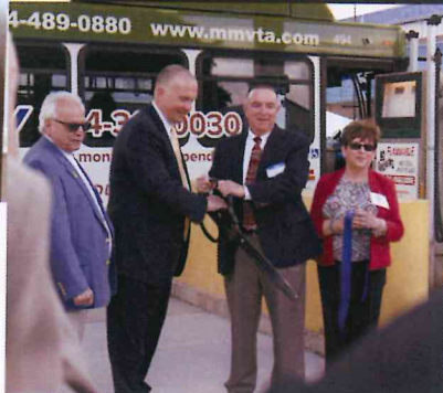
Ribbon cuttings at MMV Transit Authority CNG fueling station and cfsbank's new Southpointe location