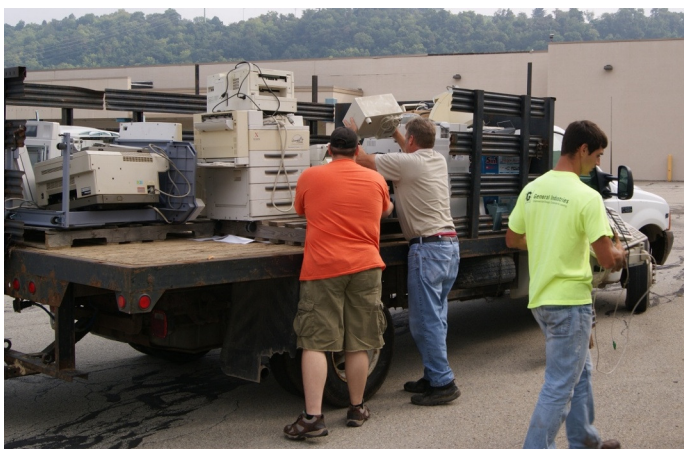
Workers from General Industries and Goodwill Industries unload unwanted electronics for recycling.

The Chamber's "Easy to be Green" day held on August 15 was a busy and productive day. The largest amount of e-waste ever collected by the Chamber was calculated to be 9,400 pounds. Goodwill of Southwestern Pennsylvania, a leader in the nationwide effort to deal with the fast-growing problem called "e-waste," will refurbish and recycle the donated computers. Through the Chamber's Green Day event two truckloads of recyclable goods were collected and kept out of landfills!