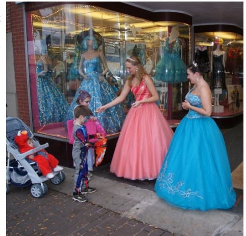
Zelenski's Bridal was just one of the many merchants that participated in the Downtown Trick-or-Treat last year.

Thank You to Our Sponsors: Charleroi Chiropractic, Inc., Corning Federal Credit Union, Davies Ford of Charleroi and Maple Creek Distributors.