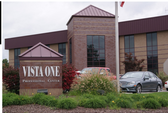
Vista One Professional Plaza at Speers Industrial Park

An integral part of the GI business structure is supporting and encouraging the growth of the Mon Valley and recognizing the importance of nurturing the place where we live and work. GI has self-developed various real estate developments in the area including Vista One Professional Center, Speers Development I & II and WillowPointe Plaza.