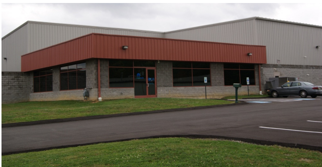
Aquatech International at Speers Industrial Park

Currently GI is completing projects for Brownsville Marine Products and Dura-Bond Industries. A few new projects in progress include Plum Borough Municipal Center, Washington Ford, Aquatech International and most recently Pediatric Associates of Westmoreland and XTO Energy Inc.