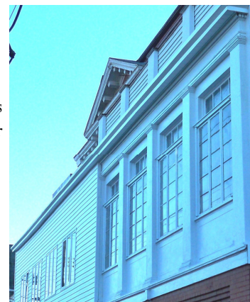
Charleroi Elks Club received a $5,000 grant through this program.

Grants will be made on a 1 to 2 matching basis (one dollar of grant money for each two dollars of private investment) with a maximum grant amount of $5,000.00 per property . Grants will be awarded on a first come, first serve basis (based on numbered file with will be opened for each preliminary application when submitted). Minimum grant is $1,000 per property, i.e., must be at least $2,000 investment . Grants will be a reimbursement basis only.