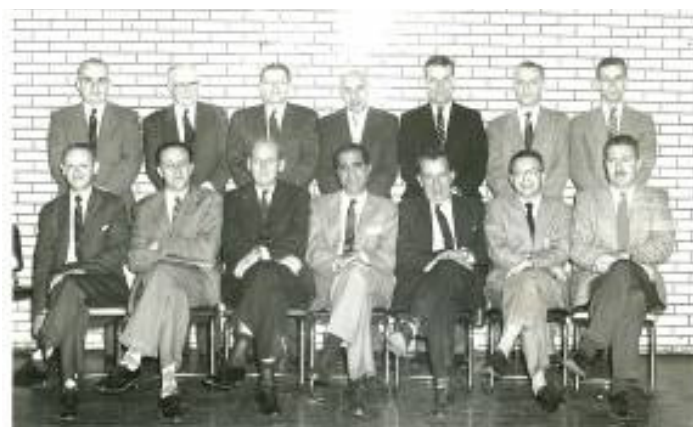
This 1955 Chamber Board picture shows all male representation. Today's Board is 40% female and employs a female Chamber Director.