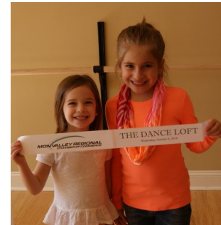
THE DANCE LOFT Charleroi