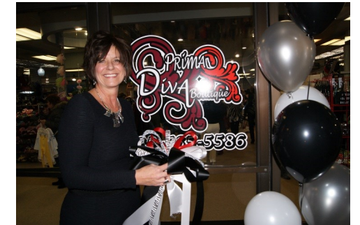
PRIMA DIVA BOUTIQUE Charleroi