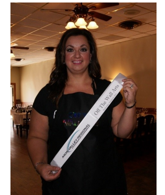
OFF THE WALL ARTS Charleroi