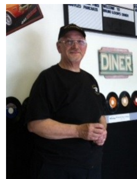
BRUNO AND SONS Charleroi