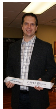
OSPTA HOSPICE North Charleroi