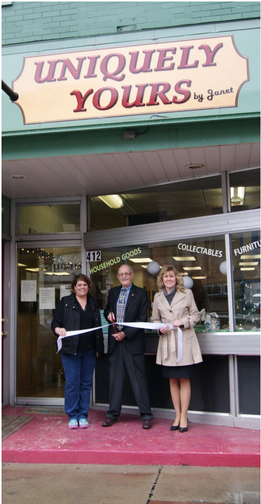
The Mon Valley Regional Chamber of Commerce recently presided over a ribbon cutting ceremonies in the Borough of Charleroi.