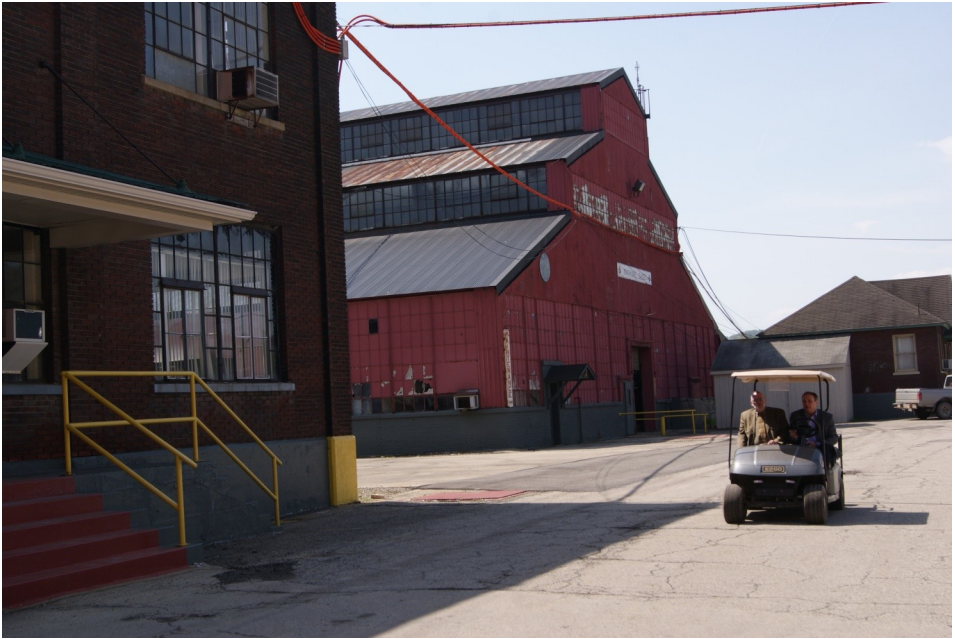
Chamber and Charleroi Borough officials recently toured Mon River Industrial Group’s business park, located at the former Allenport site of Wheeling Pittsburgh Steel.

*These renewals only reflect dues received as of April 30, 2014. Renewals will continue to be acknowledged in upcoming editions of the Regional Reporter