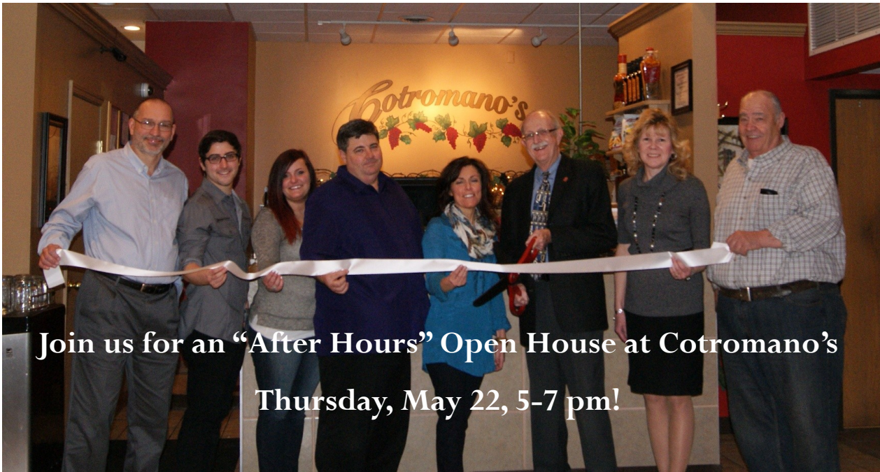
Join us for an “After Hours” Open House at Cotromano’s Thursday, May 22, 5-7 pm!