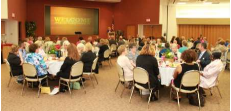
More than 100 people attended the Linen Ingathering hosted by Auxiliary of Mon-Vale Health Resources, Inc. at Monongahela Valley Hospital on May 2.

The members of the Auxiliary of Mon-Vale Health Resources, Inc. are always busy raising money for Monongahela Valley Hospital. From operating the Gift Shop to planning and working the seasonal festivals and merchandise/food sales, the Auxilians are present at the hospital daily.