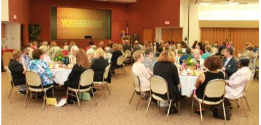
More than 100 people attended the Linen Ingathering hosted by Auxiliary of Mon-Vale Health Resources, Inc. at Monongahela Valley Hospital on May 2.

The members of the Auxiliary of Mon-Vale Health Resources, Inc. are always busy raising money for Monongahela Valley Hospital. From operating the Gift Shop to planning and working the seasonal festivals and merchandise/food sales, the Auxilians are present at the hospital daily.