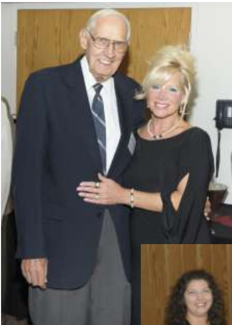
Scenes from the Chamber's Annual Awards Event held on September 8, 2016.

More photos can be found on the Chamber's Facebook page.