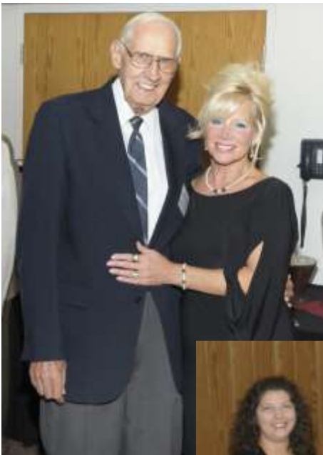
Scenes from the Chamber's Annual Awards Event held on September 8, 2016.

More photos can be found on the Chamber's Facebook page.