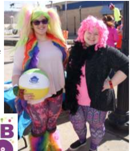
More pictures can be found on the MVRCC FaceBook page.

Sponsored by: Washington County Tourism Promotion Agency